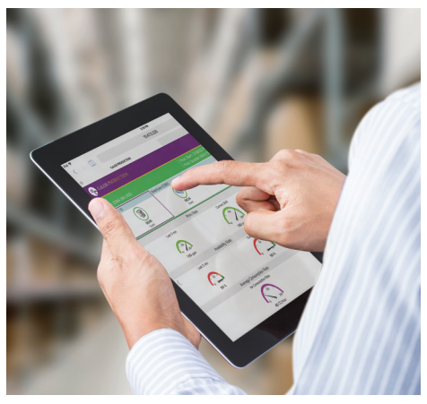
Remote dashboards on your mobile devices

Identify existing bottlenecks and performance losses due to usage issues to implement process improvements on continuous basis.