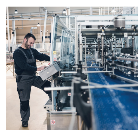
Printer performance dashboard integrated into production-line terminals

Access your printer data and performance dashboard from any compatible user interface or mobile device connected to your factory network.