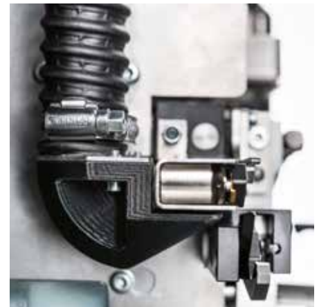
Optional suction unit for stripping remnants